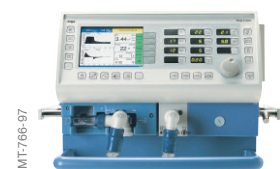
Evita 2 dura