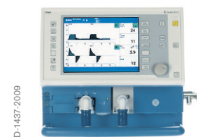
Evita 4 edition