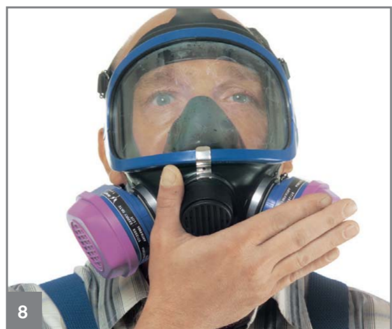
8 Positive pressure test: Seal off the protective cap of the exhalation valve with your palm and exhale. The mask will inflate slightly. If the mask does not inflate slightly, readjust the face piece and adjust headstraps or use a different mask size. Repeat the test until a successful fit check is met.

Warning: Beards in the sealing area of the mask can cause leaks. Always make sure the mask forms a tight seal and the filter is attached prior to entering a hazardous atmosphere. This poster is not a replacement for reading and understanding the instructions for use for the subject mask and respective filter cartridge, both of which must be read before using either item! Failure to do so could result in sickness or death! For further assistance concerning proper use, ask your supervisor or call your local Dräger organization at +1 800 922 5518.