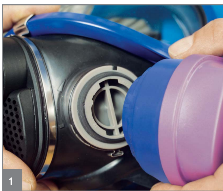
1 Attach the bayonet cartridges on the mask body.