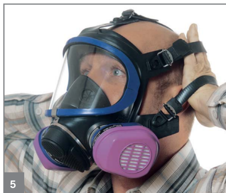
5 Fit harness over the head until the mask is in position.