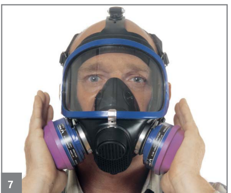
7 Negative pressure test: Seal both respiratory filters with your hands and breathe in until a negative pressure (suction) is generated. Hold your breath for a moment. The negative pressure should be maintained. If not, readjust the face piece and adjust the straps. Repeat test until a successful fit check is met.