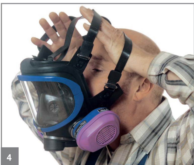
4 First insert chin in chinpiece of mask.