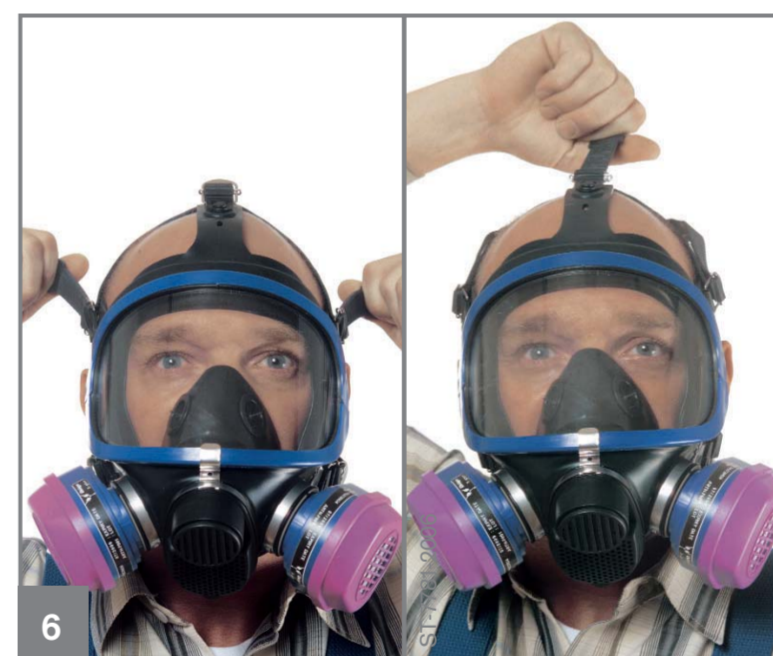
6 Tighten straps until the mask fits snug and secure. First tighten both neck straps, then both temple straps and tighten front strap if necessary.