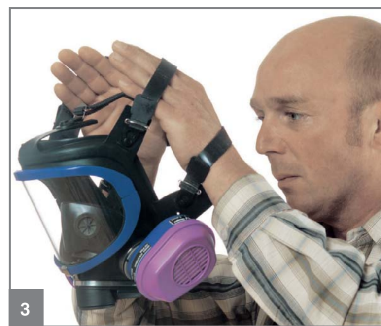
3 Open straps as far as possible. Direct the mask towards the face.