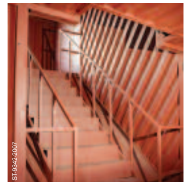
Interior stairwell is equipped with hand rails on either side which adhere to OSHA regulations.