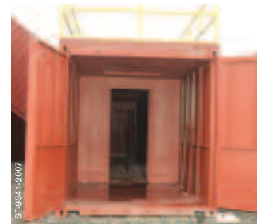
The Phase 5 system – the Burn Chamber located on the first floor.

This workshop is conducted by two experienced instructors. These instructors have conducted at least 100 training evolutions in a Phase 5 system. This training and certification process assures that instructors are thoroughly familiarized with the safe and effective use of the Dräger Swede Survival Phase 5 training system.